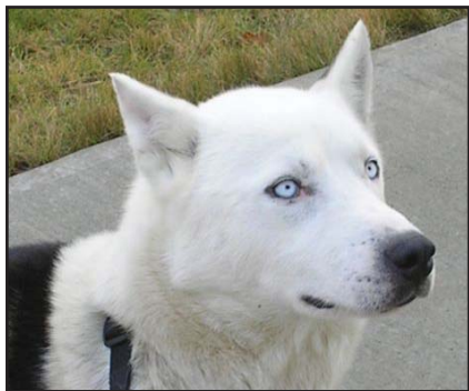
Phil , a 4-year-old husky, was recently surrendered to the SPCA by his guardian. Very affectionate and playful with people, he is a little too curious to be in a home with cats. He is neutered and up-to-date on vaccinations.