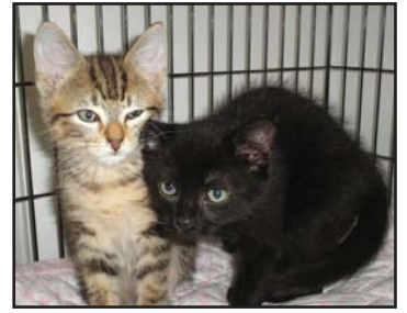
The SPCA currently has kittens. When they arrive, they are typically placed very quickly.

Volunteers and donors: the SPCA of Hancock County owes its success to you! We celebrate you for your commitment, energy, enthusiasm, and generosity. Each of you has made a difference in the lives of animals and in our community. Did you know that---